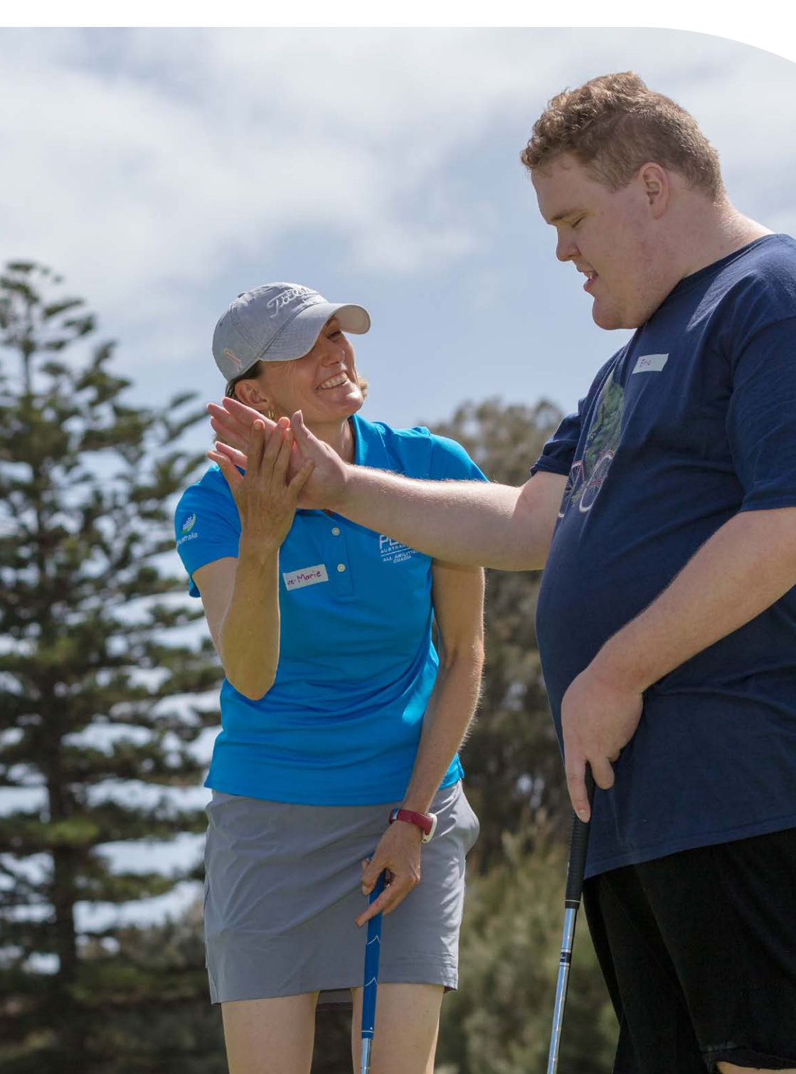
ALL ABILITIES PROGRAMS